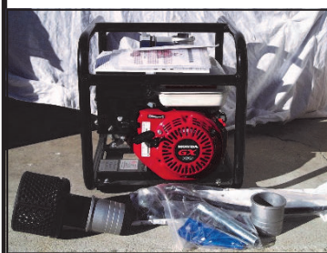
Honda Gas Powered 3x3 Contractor Grade Water Pump