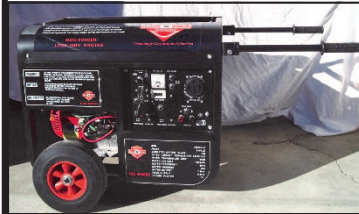
Honda 16hp, 9000 Watt Gas Generator w/ '0' Hours!

H.D. Power HDD7000ED Diesel Generator w/ ONLY 17 HOURS! 7000W-Runs 22 hrs on 1 tank diesel