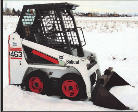
2006 Bobcat Skidsteer, Model 463, 545 hrs, w/Forks, Backhoe & 2 Buckets -44" & 36"

PRE-APPROVED BANK LETTER OF GUARANTEE REQUIRED TO PURCHASE $5000+ IN EQUIPMENT BY PERSONAL OR BUSINESS CHECK. CALL US TODAY.