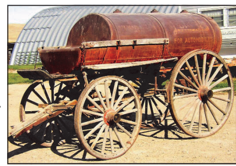
All Original 'Standard Oil' Fuel Wagon in Great Condition! All running gear works, tank is good too! Circa early 1900s.