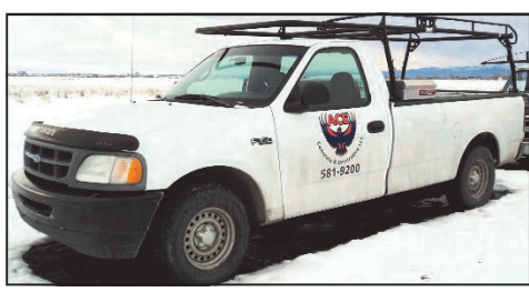
1997 Ford F150 Truck, 1/2 Ton, 2WD, 160057 Miles w/Tool Box & Lumber Rack