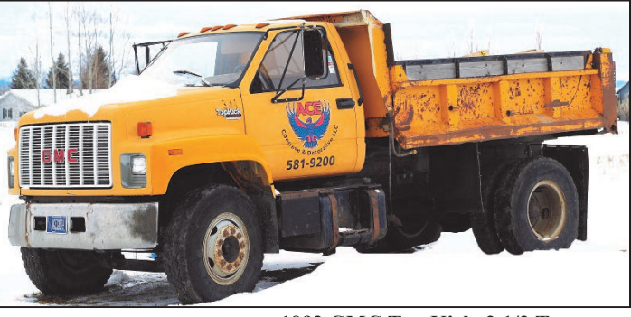
1992 GMC Top Kick, 2 1/2 Ton, 6 Yard Capacity Dump Truck Gas, 5 Spd Auto, only 52,439 Miles