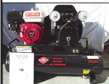
H.D. Power Indust. Compressor Gas Honda Motor - w/ '0' HOURS!

1987 Ford F350, 1Ton, 4x2, 3 yd Dump Truck 5 speed manual, gas engine 40,443 miles, runs good.