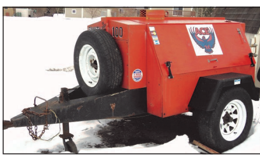
1998 Smith 100 cu. ft. Air Compressor Trailer, Ford 6 cyl. Engine, only 326 Hours!